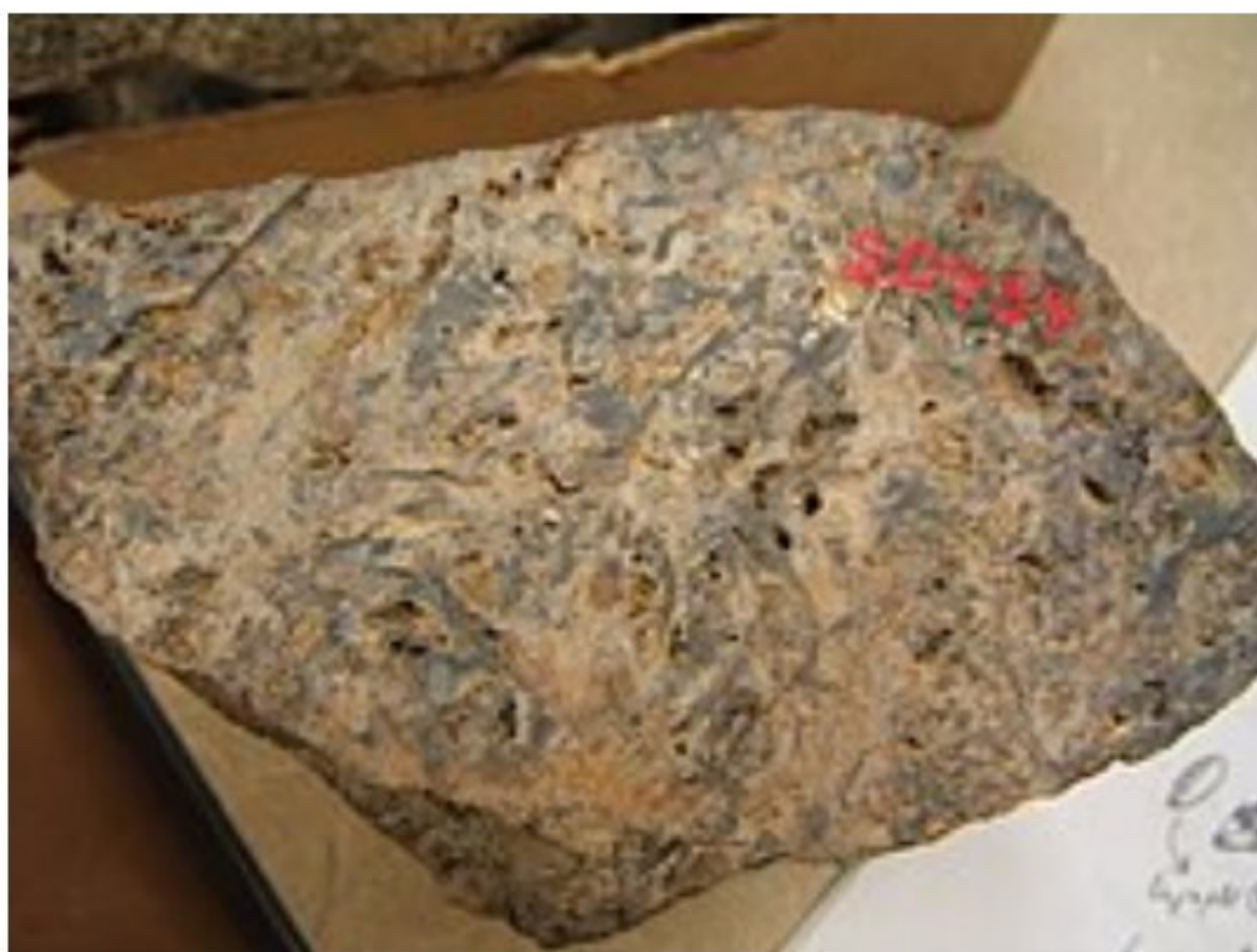
An unpolished hand sample of the Lower Devonian Rhynie

Macroscopic remains of true vascular plants are first found in the fossil record during the Silurian Period of the Paleozoic era. Some dispersed, fragmentary fossils of disputed affinity, primarily spores and cuticles , have been found in rocks from the Ordovician Period in Oman , and are thought to derive from liverwort - or moss -grade fossil plants. [10]