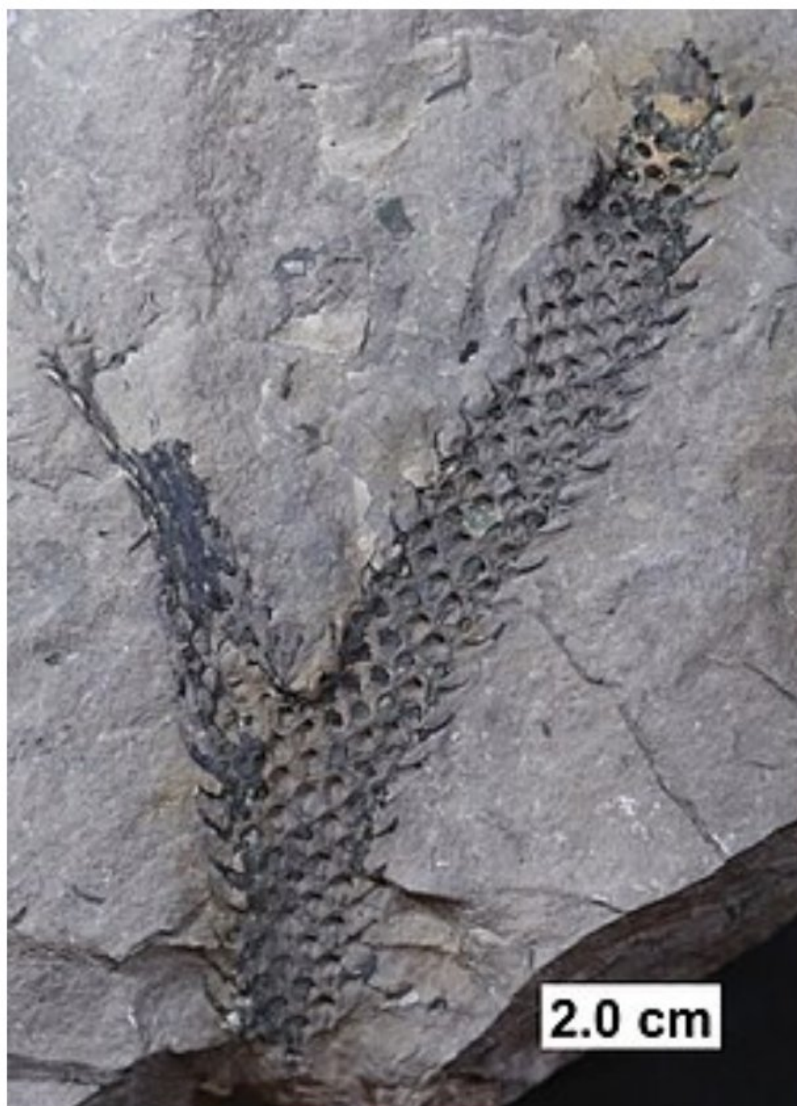
Lycopod axis (branch) from the Middle Devonian